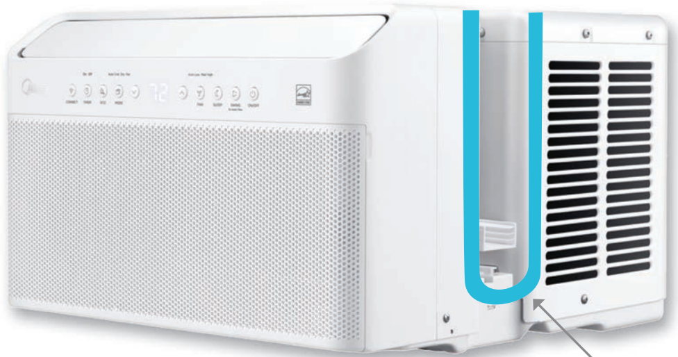
Unique U-Shaped Design allows open/close window usage

The strong airflow allows you to feel the cold air up to 20 feet away.